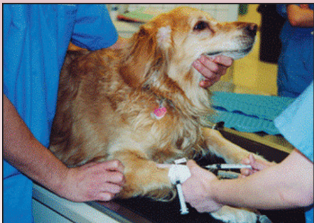
A veterinary technician administers medications through an intravenous catheter to induce general anesthesia in a dog.

Anesthetics are selected for patients based on their health status as determined by physical examination, laboratory results and other diagnostic aids, and the type and length of the procedure to be performed. For example, some injectable anesthetics require breakdown by the liver for the patient to recover from the sedative effects. If the liver is not functioning properly, anesthetic agents requiring deactivation by the liver would not be used, and other agents would be selected for anesthesia.