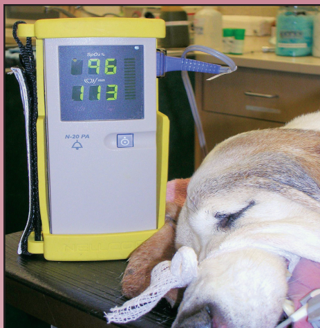
A pulse oximeter monitors oxygen saturation on this anesthetized patient.